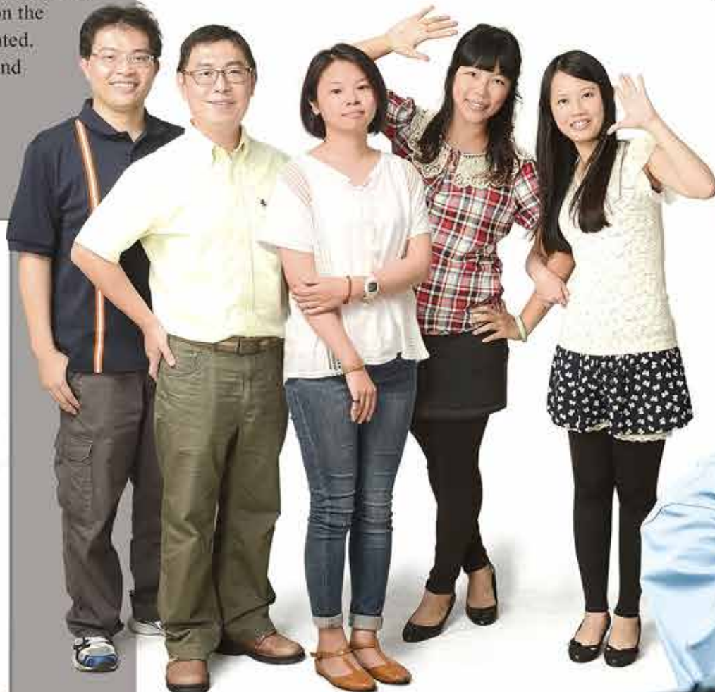
▲ Our professional team of quality assurance