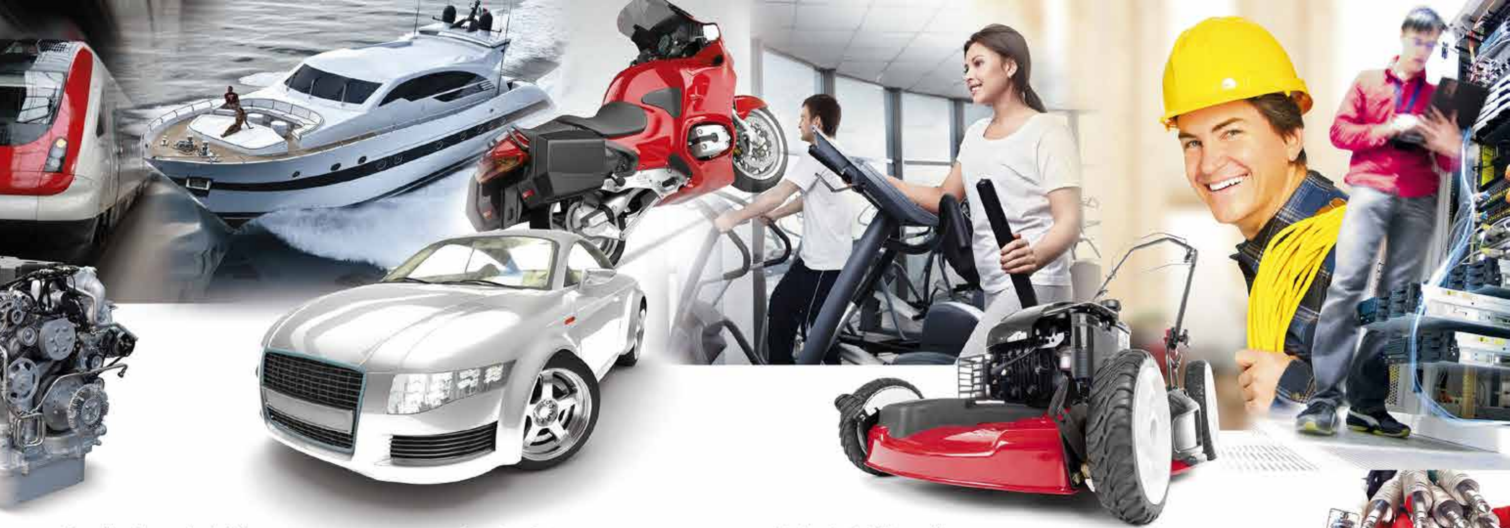
Prevailing Torque Lock Nuts